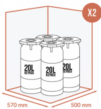
JUSQU'À 8 X 20 LITRES KEYKEG